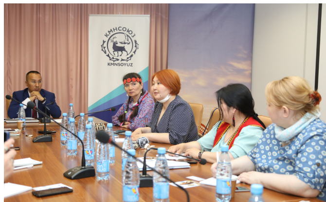
Seminar of the IPO «KMNSOYUZ», Dudinka, June 22–23, 2021

On the other hand, business can support languages not only financially, but also use languages in their direct activities, for example, using them on product packaging and in visual appearance of their products. Such measures increase prestige of languages and expand the scope of their use. Respect for Indigenous languages can be enshrined in corporate policies of industrial enterprises.