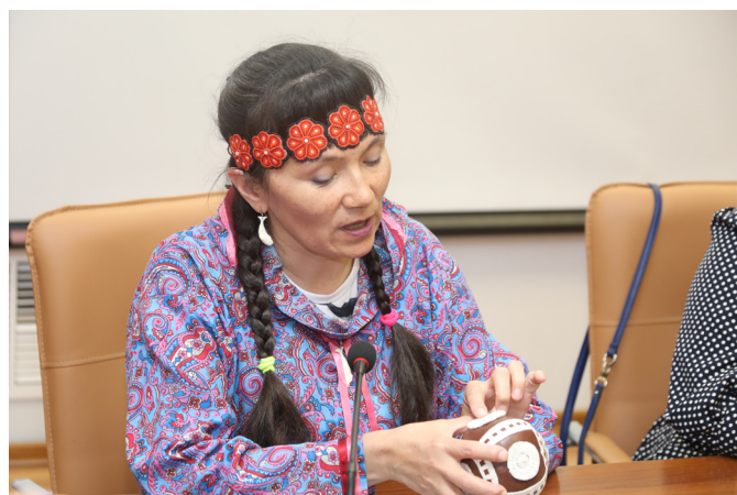
Seminar of the IPO «KMNSOYUZ», Dudinka, June 22–23, 2021

Indigenous businesses support and develop crafts and traditional life styles, and in so doing